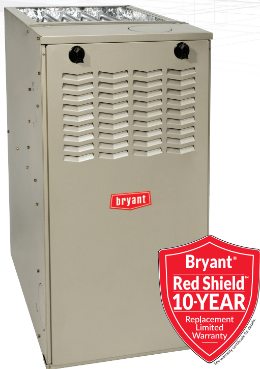
Control and Smart Sensor sold separately