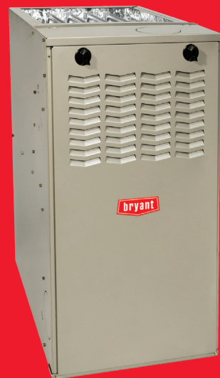
Models 880T, 881T